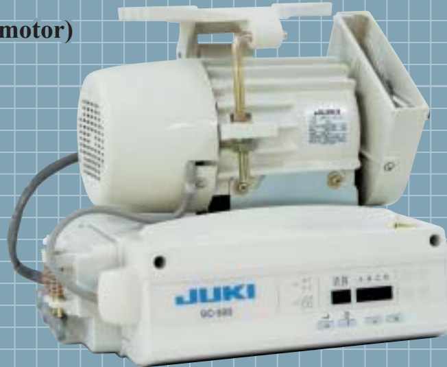
M50 (AC servomotor)